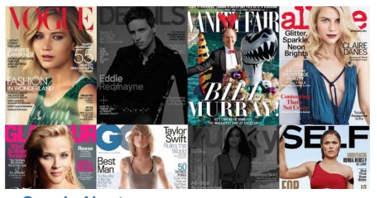
Conde Nast Workplace Shadowing

Conde Nast offer Workplace Shadowing in many of their departments.