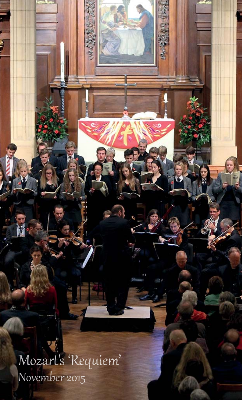
Mozart's 'Requiem' November 2015