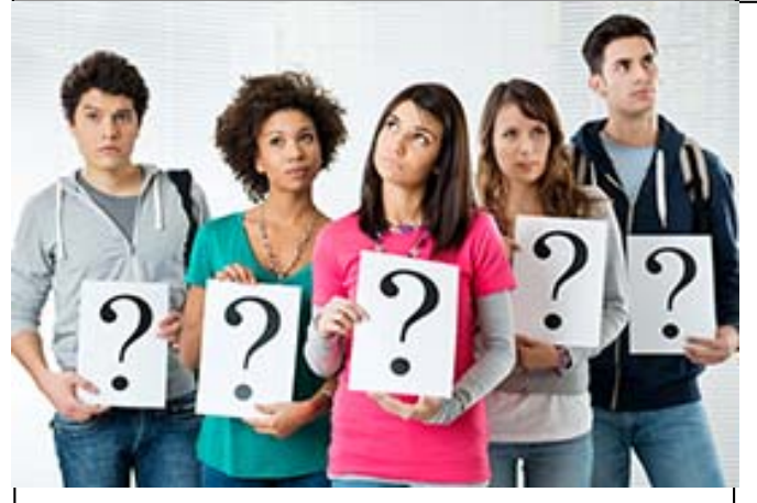
Unconditional Offers Made to a Third of Young Applicants

UCAS' 2018 End of Cycle Report shows 87540 university applicants who are yet to complete their qualifications have received a university offer that could be considered unconditional.