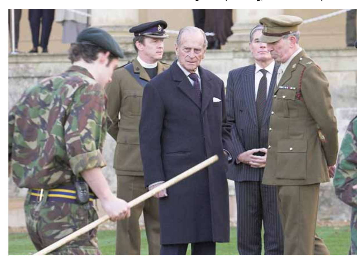
An extensive range of photographs capturing that special moment for as many people as possible is available in a special photo gallery on our website: www.stowe.co.uk